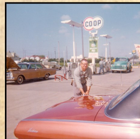
Several vehicles pump fuel outside the cooperative's original gas station.