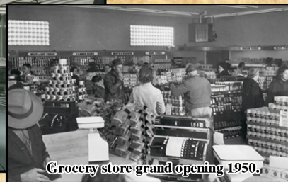
Grocery store grand opening 1950.