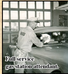
Full service gas station attendant.

1950 – Consumers Cooperative Association opens a grocery store, directly west of the gas station at 3rd & Black Hills.