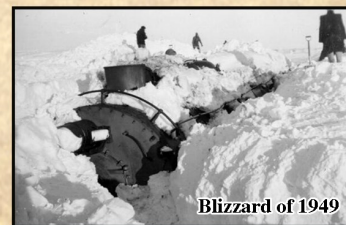
Blizzard of 1949

1949 - Consumers establishes its Petroleum Division. During the Great Blizzard of 1949, Consumers distinguished itself by making fuel deliveries that other dealers were unwilling or unable to attempt.